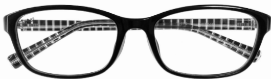
col.6 BK II