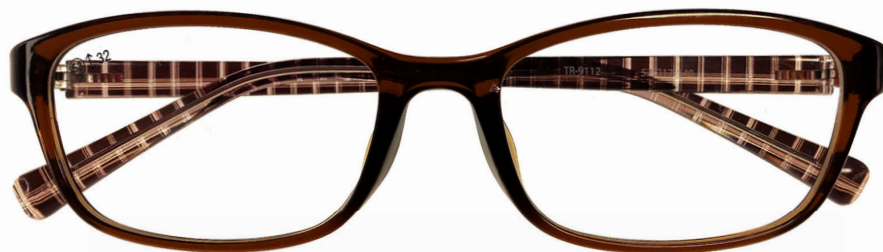
col.7 BR II